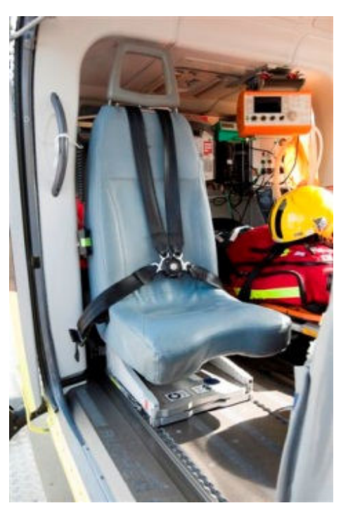
The swivel doctor seat in the rear.