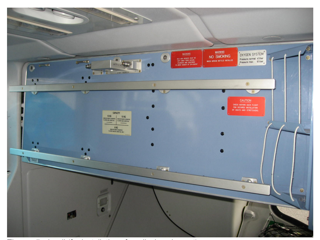
The medical wall (for installation of medical equipment)