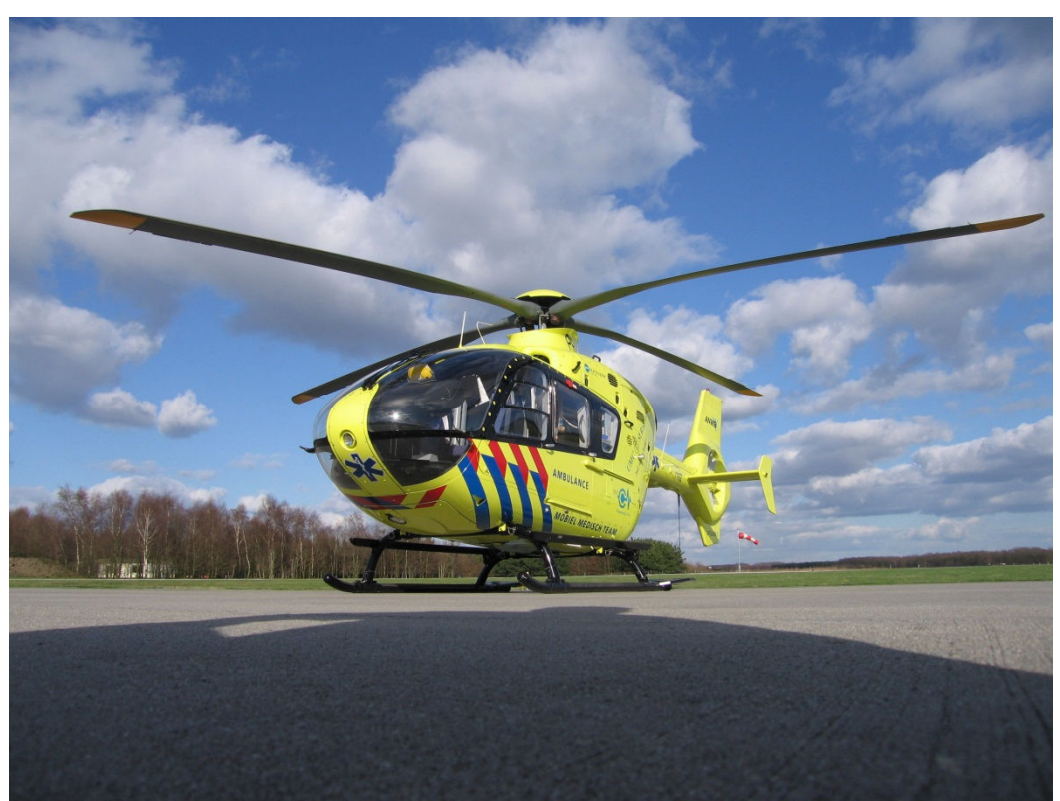
The helicopter on it's base