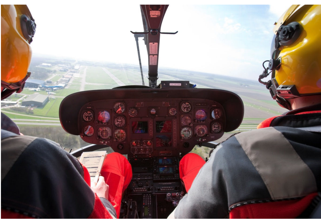
The cockpit (Dual Pilot IFR)