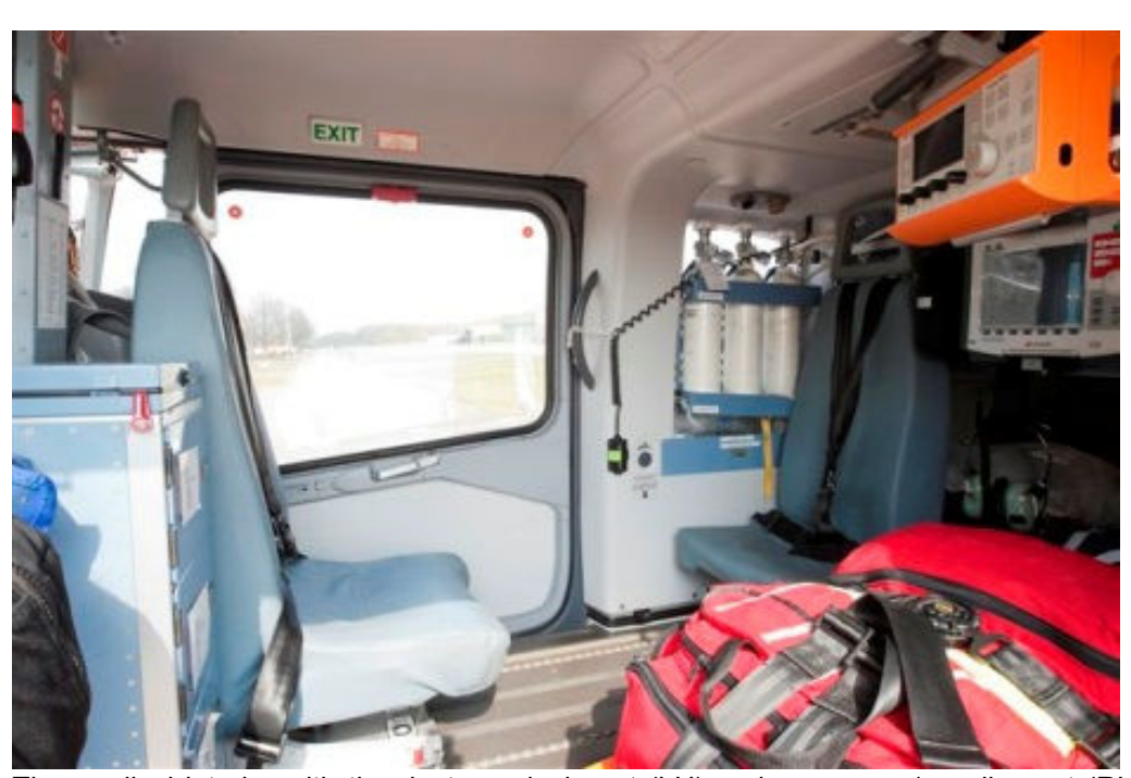
The medical interior with the doctor swivel seat (LH) and passenger/ medic seat (RH) and oxygen bottle's installed.