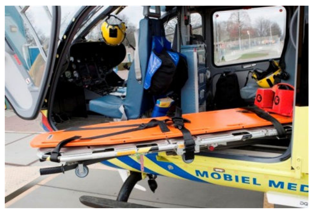
The Side loading stretcher (rear loading also possible)