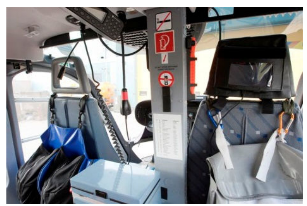
View from the rear